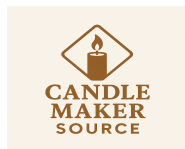
Fig and Sandalwood